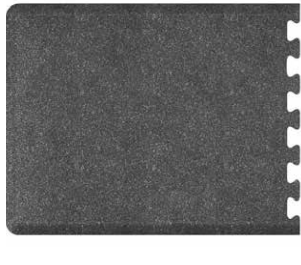
Puzzle Runner Mosaic Mat