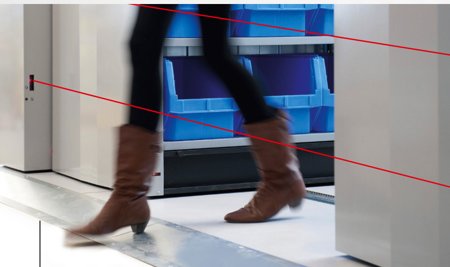
Foot-level safety light barriers for additional protection