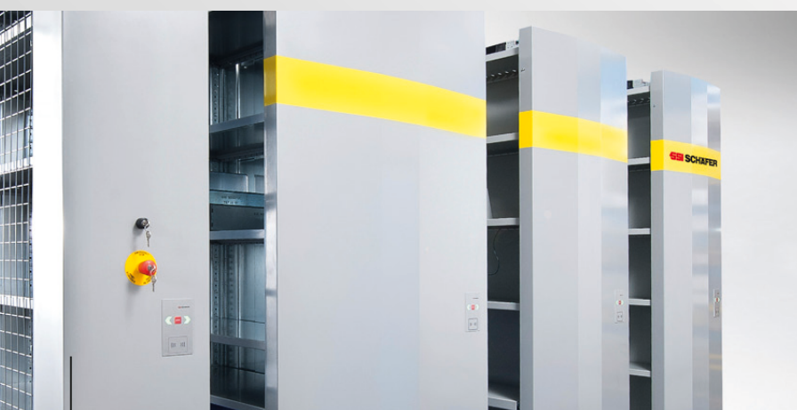
Control options distance controls as access for fire prevention or for ventilating archived documents