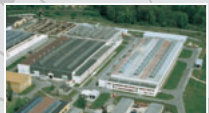
Czech Republic, Hranice