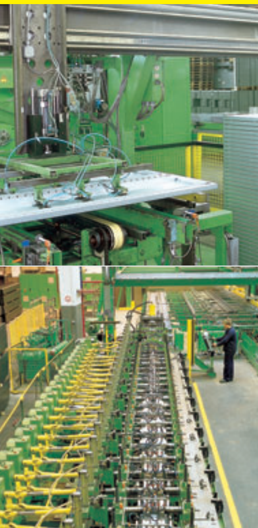
FRITZ SCHÄFER GMBH, Neunkirchen