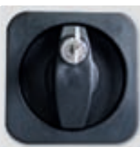
Rotary handle with cylinder lock