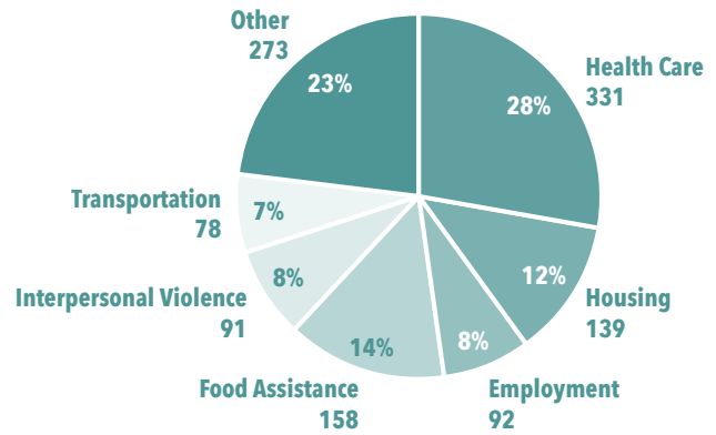
Chart II. Organizations Engaged by Domain

The NCCARE360 Advisory Council met for the first time on March 20, 2019. The Council includes members from a variety of professions and regions of North Carolina, and council members act as ambassadors for NCCARE360, contribute input for ongoing development of network functionalities, and serve as the voice of their communities by listening to and sharing community feedback. During the first meeting, a council member from Alamance County involved in the rollout of NCCARE360 shared appreciation for the manner in which the implementation team worked with the organization to make NCCARE360 work for the organization, emphasizing flexibility in design to meet organizational needs and workflow.