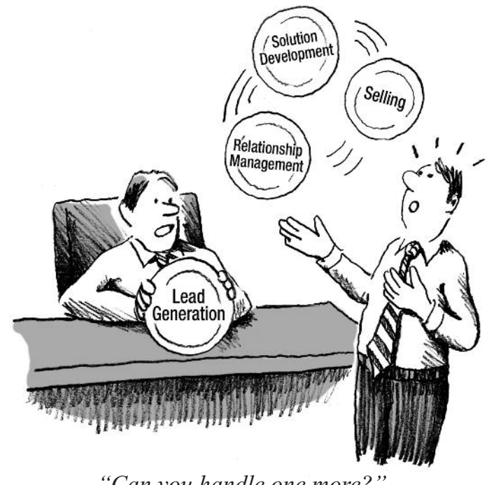
"Can you handle one more?"

"Logistics businesses that ask salespeople to generate all their leads, as well as work and close sales opportunities, ignore the fact that these roles, while complementary, require different skill sets."