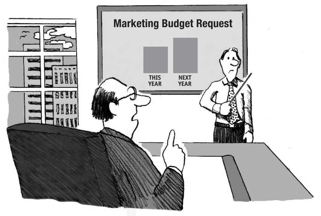
"Okay, run it past me one more time... how will increased web traffic help us get to ten million in new sales?"

investment. That means having a CRM system and established procedures to log and track leads through each stage of the buying cycle.