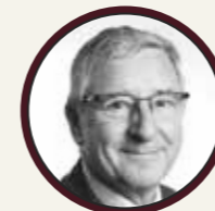
Vice-Chair Jim Fitzpatrick MP