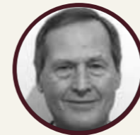
Secretary Lord Alan Howarth