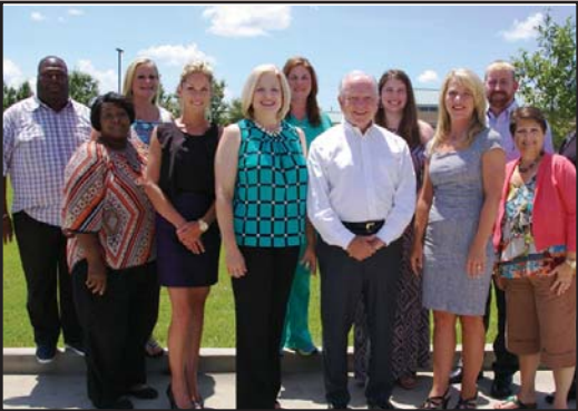
Lane Behavioral Health Services