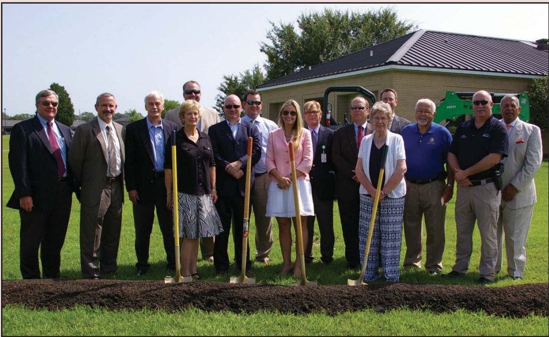
Breaking ground on the new AMG Specialty Hospital.