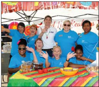
Chili Cook-off Winners! Page 5