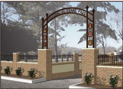
Regional Veterans Park

It is with great pleasure that we again thank YOU, our patients, families and community members, for allowing our dedicated team of professionals to do what they do best – provide the community with the greatest healthcare services possible.