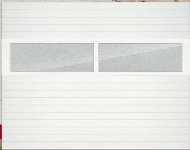
9' x 7' 3285 white with optional white aluminum full-view window section