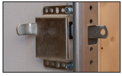
INSIDE SIDE LOCK

An exhaust port is an optional feature to keep those unwanted fumes from lingering around the work area