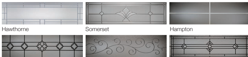
Newport Florence Temple Hawthorne and Somerset shown in platinum leading; also available in brass leading.