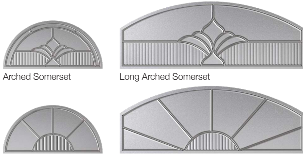
Somerset and Monticello shown in platinum leading and are also available with brass leading.