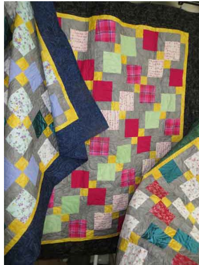
Set of 3 quilts made from nightgowns and blouses.

You can use just about any material in your quilt. Just note that if an item is "dry-clean only", the quilt you put it into also becomes "dry-clean only."