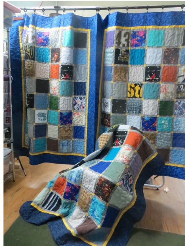
Set of 3 quilts made from polo shirts, shirts and jeans. Traditional style quilt