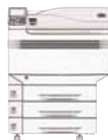
2nd + 3rd Tray with Castor 1,890 sheets