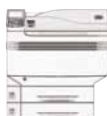
2nd Tray 1,360 sheets