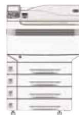
HCF 2,420 sheets