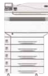
2nd Tray with HCF 2,950 sheets