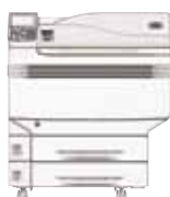
2nd Tray with Castor 1,360 sheets