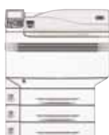
2nd + 3rd Tray 1,890 sheets