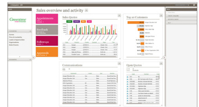
Know what's happening in a glance: Workspace showing badges and four open panels.

need to keep at hand. Choose to present the information as a badge or load into the Views Tray to keep in constant view (check out the Workspace video for more on this). The badges highlight key facts such as overdue tasks and alerts across a comprehensive range of intelligence.