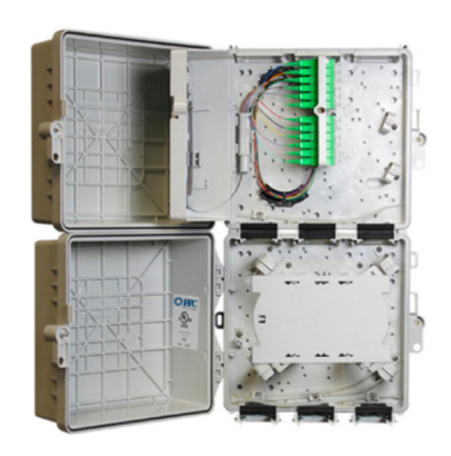
SFIT-FT12AANBM-008 SFIT-FT12AANNO SFIT-FT12AANBO SFIT-FT24AANNO SFIT-FT24AANBO