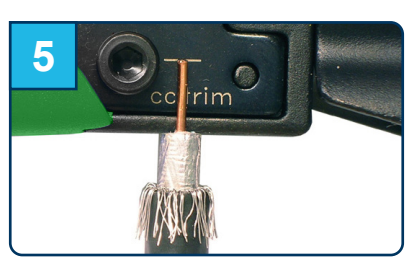
Use the guage on the VT tool to check the dimension of the center conductor.