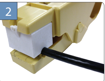
tool in good condition, prepare cable to 1/4" x 1/4" dimensions. Use edge of tool if no stop