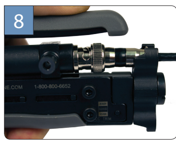
Using your VT-HE compression tool, make sure the rotating compression head is positioned for BNC as shown in the picture. Properly seat connector and compress fully.