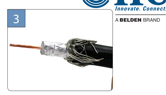
Fold back braid. If Trishield or Quadshield remove additional foil layer and fold back remaining braid.