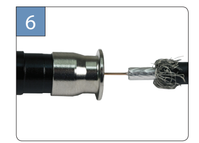
Insert the cable into the back of the connector and into the floating pin. Push the connector on while rotating until fully seated.