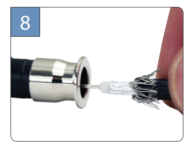
Insert the cable into the back of the connector with the step up pin and insulator guide inside the post. Push the connector on while rotating until fully seated.