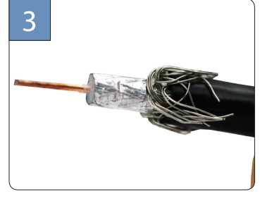
Fold back braid. If Trishield or Quadshield remove additional foil layer and fold back remaining braid.