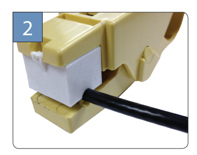
Using a fixed blade, mini prep tool in good condition, prepare cable to 1/4" x 1/4" dimensions. Use edge of tool if no stop