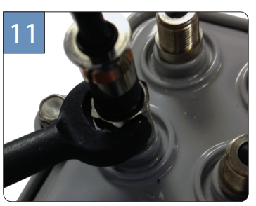
Tighten connector to recommended torque.