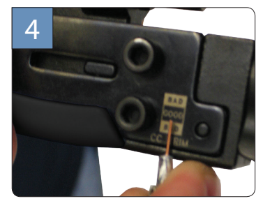
Ensure cable preparation is correct. Use gauge on VT tool to check the center conductor length.