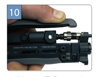
Using your VT-HE compression tool, make sure the rotating compression head is positioned for F connectors as shown in the picture. Properly seat connector and compress fully.