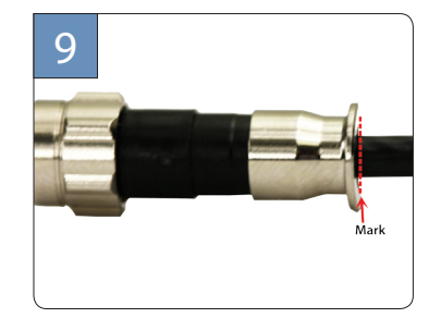
The cable mark from step 5 should line up with the back edge of the compression ring.