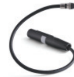
Available in AK Assembly