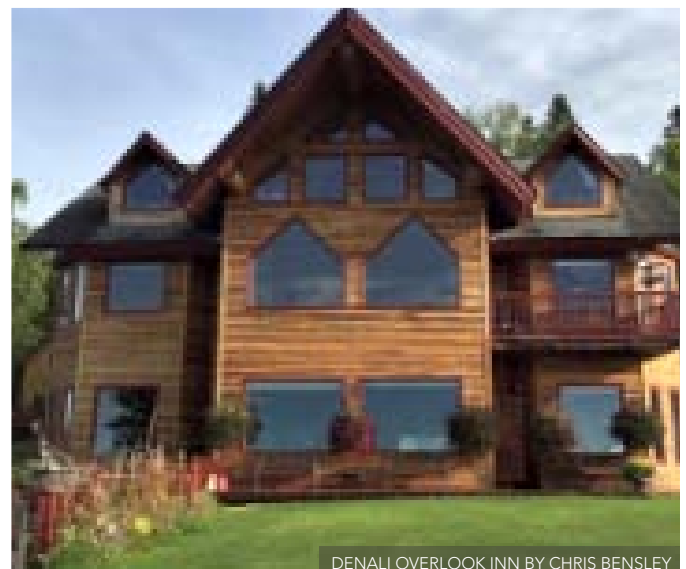
DENALI OVERLOOK INN