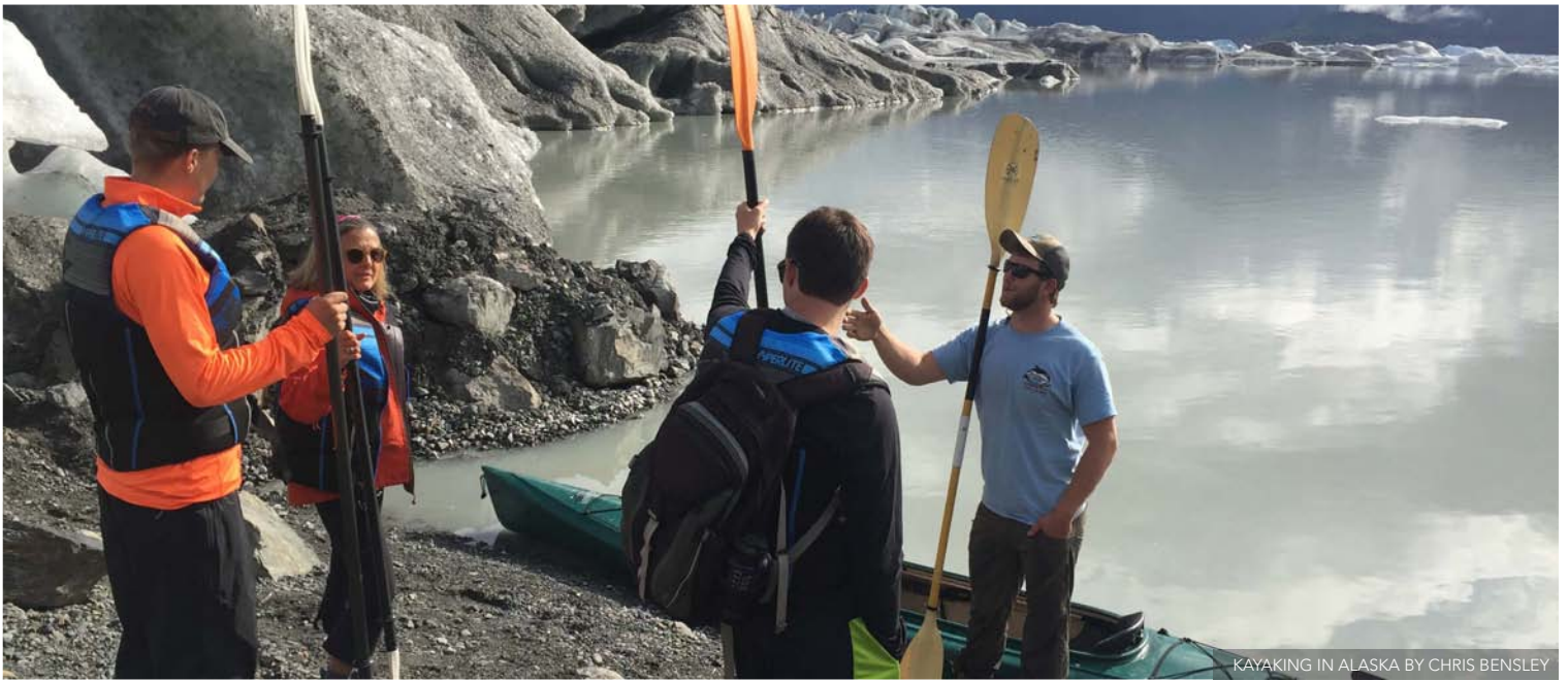
KAYAKING IN ALASKA