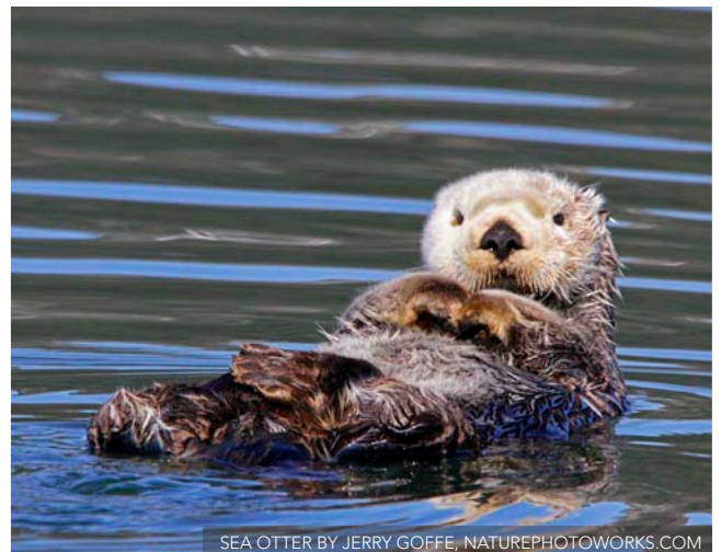
SEA OTTER

After breakfast take a boat trip to the panoramic Orca Inlet, where you will have the opportunity to see the world's largest population of sea otters and observe their interaction within the pod. Your guide for the day has been involved in sea otter studies for 15 years. Afterwards, stop at a remote beach for a short hike to explore tidepools. Next head to Hinchinbrook Island, where you will enjoy your lunch at another beautiful, remote beach. After lunch, visit a Kittiwake colony, and observe these nesting sea birds. Late afternoon, take in a discussion of the life cycle of salmon and their importance to the economy. Overnight at Orca Adventure Lodge. (BLD)