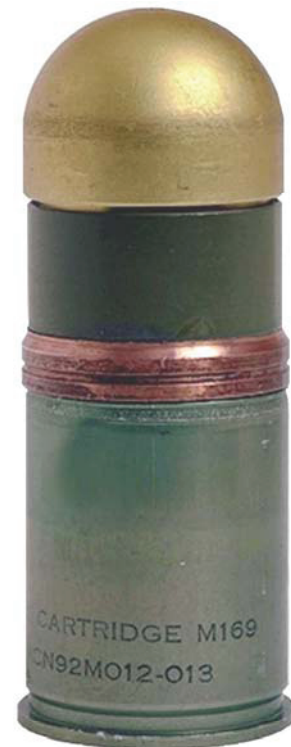
40mm Cartridge High Explosive Dual Purpose

Length: 4.42 in Weight: .75 lbs Armor Penetration: 76mm Steel Cartridge Case: M169 40x53mm Target Range: 2,000 Meters Muzzle Velocity: 241 Meters/Second Explosive Fill: Composition A5 Fuze: M549A1 or equivalent Detonator: M55 Specification/DODIC: MIL-DTL-50863/B542 NSN: 1310-01-567-5540 (Wood Pallet) 1310-01-564-2160 (Metal Pallet) Hazard Class/UN: 1.1E/0006 Packaging: 32 Linked Cartridges in PA-120 Steel Container 1,536 Cartridges per pallet