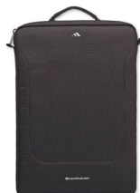
Tred Sleeve p. 15