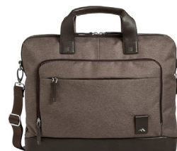
Medina Slim Brief