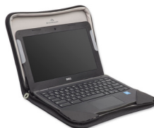
Tred Zip Folio p. 13