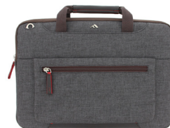
Collins Carry Case