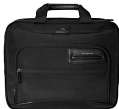
Elliot Deluxe Brief