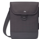
Tred Vertical MB p. 17