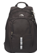
Tred Omega Backpack p.18