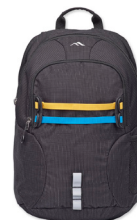
Tred Alpha Backpack p. 20