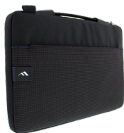
Tred Horizontal p. 16