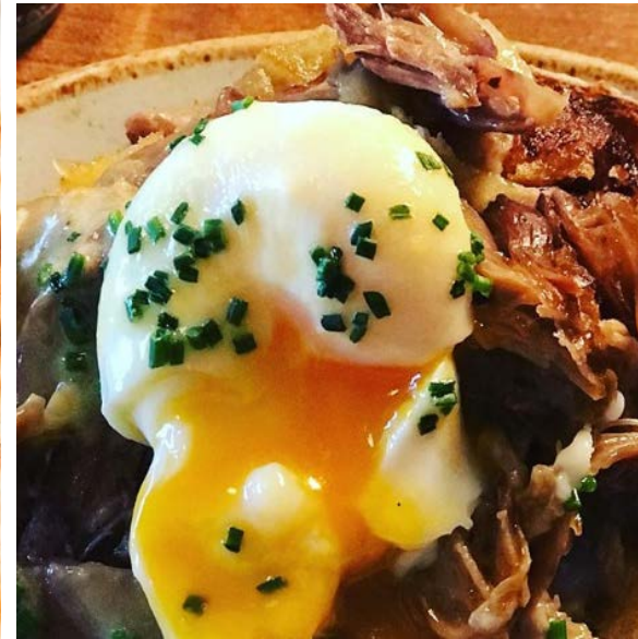
Sous Vide Egg with Duck Confit Foxcroft & Ginger (London) foxcroftandginger.co.uk