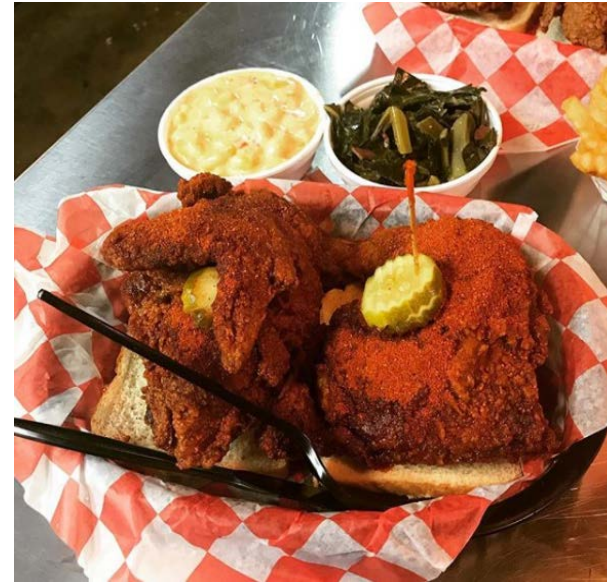
Hot Chicken Dinner Hattie B's (Nashville) hattieb.com