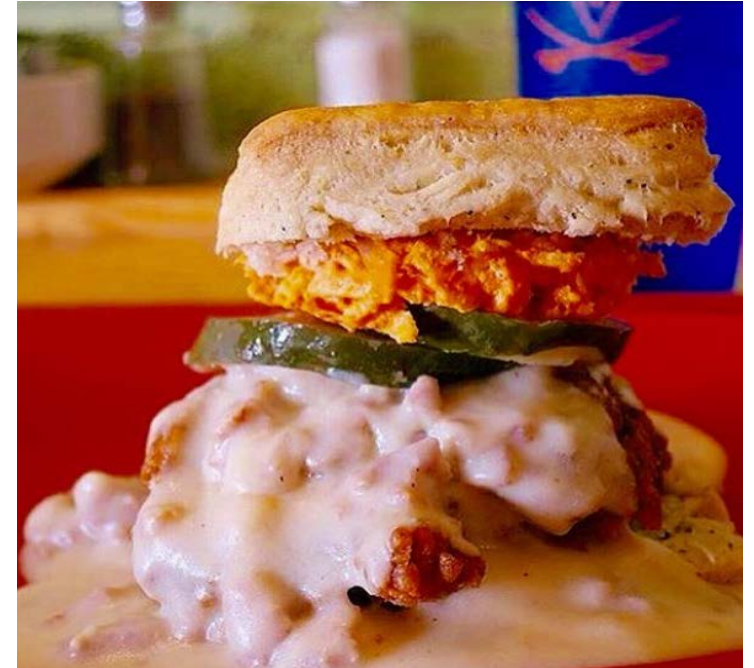
Ol' Dirty Biscuit (fried chicken, sausage gravy, dill pickles, smoked pimiento cheese) Ace Biscuit & Barbeque (Charlottesville, VA) acebiscuitandbarbecue.com