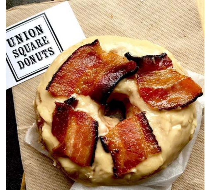
Maple Bacon Donut (Black Forest ham, Emmenthaler and American cheese, raspberry-cranberry jam) Union Square Donuts (Chicago) unionsquaredonuts.com