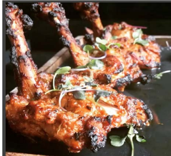
Chicken Chops (rum flambe, gram flour, chutney) aRoqa (New York City) www.aroqanyc.com