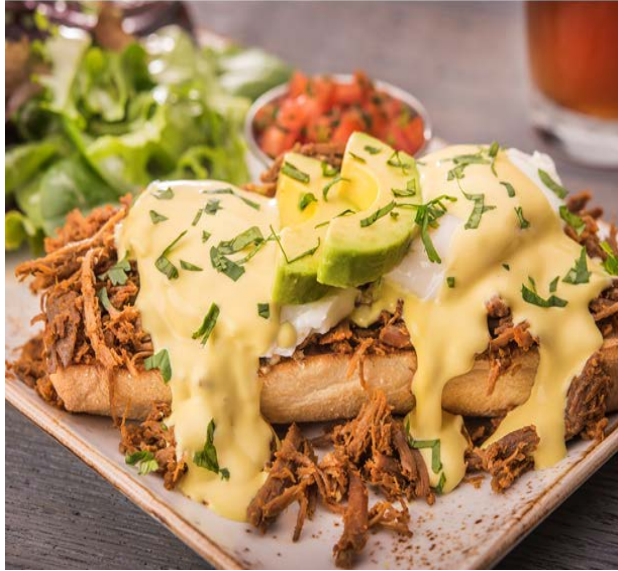
Barbacoa Benedict First Watch Café (chain) firstwatch.com