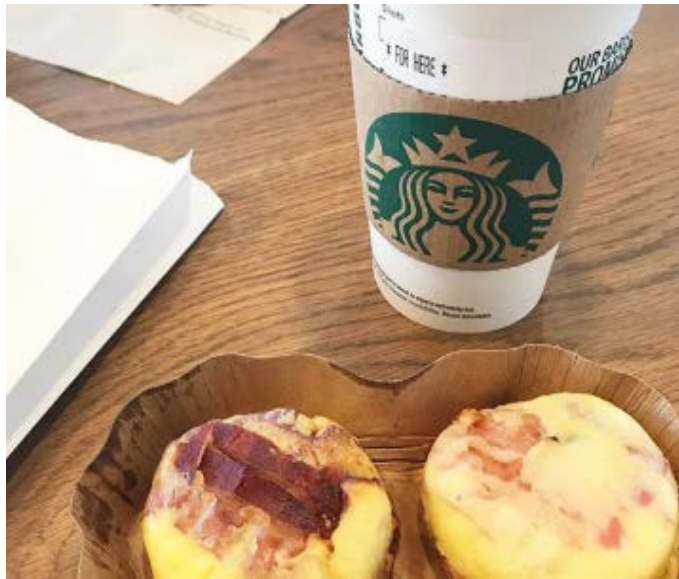
Bacon & Gruyere Sous Vide Egg Bite at Starbucks