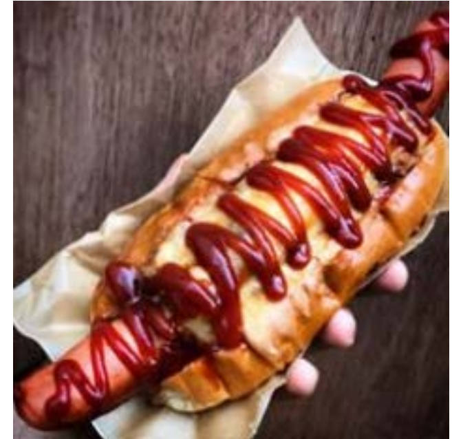
Deputy Dog (w/North Carolina pulled pork, chilli vinegar mop, chipotle bbq sauce, melted cheddar) Oh My Dog (London) omdhotdogs.co.uk