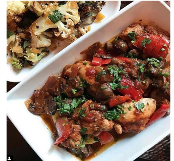
Pollo al Ajillo (slow-cooked chicken thigh w/ black garlic) Bazaar by Jose Andres (Miami Beach) sbe.com/restaurants/brands/ thebazaar