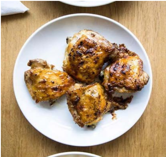
Organic Chicken Thighs (with crispy skin, creamy leek & garlic sauce) City Kitchen (Sacramento) citykitchensacramento.com