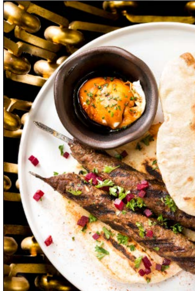
Onsen Egg, Sweet Mushroom Soy, Laffa Bread Sparrow + Wolf (Las Vegas) sparrowandwolflv.com