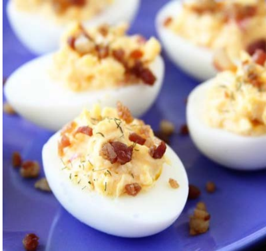
Pimiento Cheese Deviled Eggs