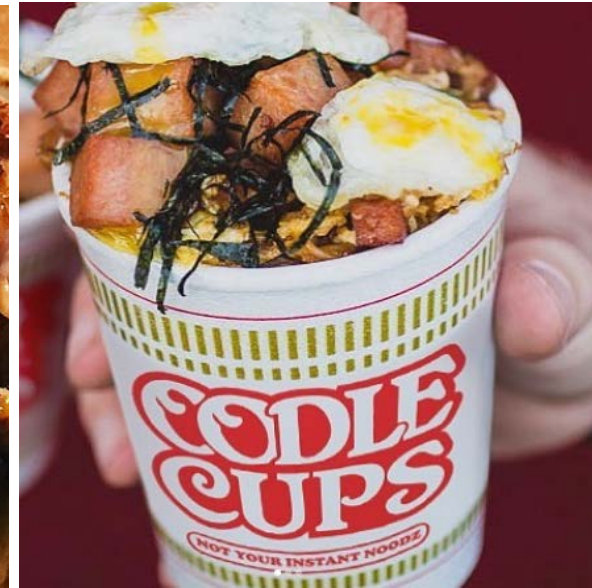
Cup noodles fried and topped with spam, sous vide egg, nori Off the Grid (San Francisco) offthegrid.com