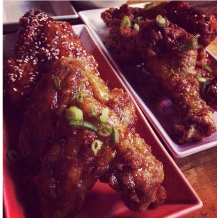
Korean Fried Chicken Jubo (London)