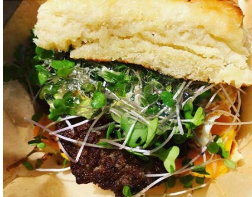
Buttermilk Biscuit w/ Anderson Farms Sausage (Piedmont Provisions rosemary habanero jam, Full Moon Athens micro greens, Pastures of Rock Creek egg and cheddar cheese) Farm Cart (Athens, GA) athensfarmersmarket.net/farm-cart/