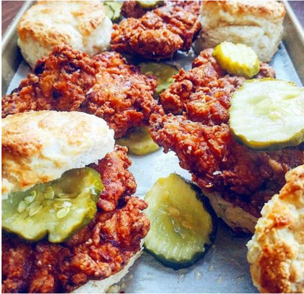
Hot Fried Chicken & Biscuit Brwnbread (Baltimore)