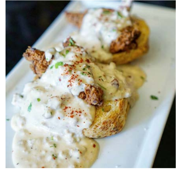
Nighthawk Breakfast Bar (Los Angeles and Chicago) Fried Chicken with Gravy Biscuits