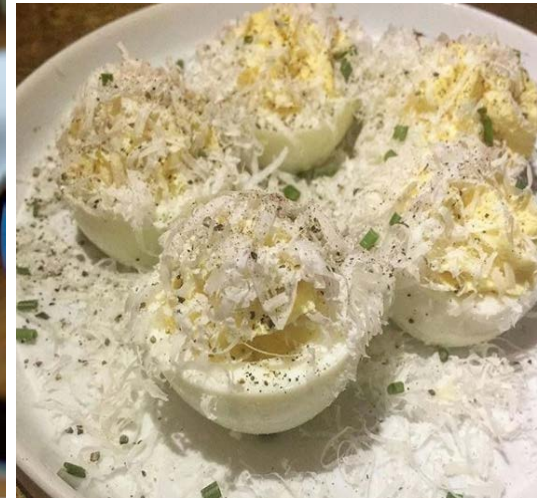
Deviled Eggs "Cacio e Pepe"

(dill, chives, smoked trout roe) Yardbird Southern (Miami) runchickenrun.com