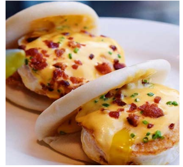
Breakfast Bao Momofuku Noodle Bar (New York City) noodlebar-ny.momofuku.com