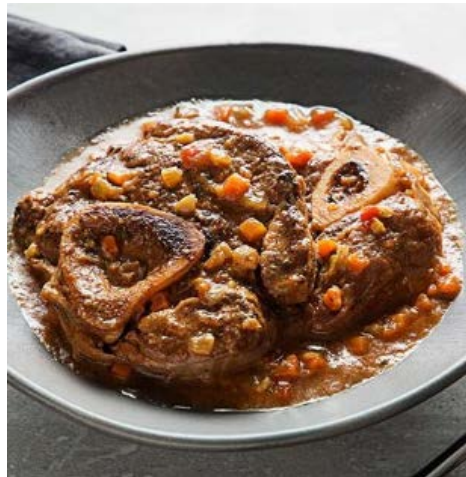
Osso Buco (sous vide) Cuisine Solutions cuisinesolutions.com