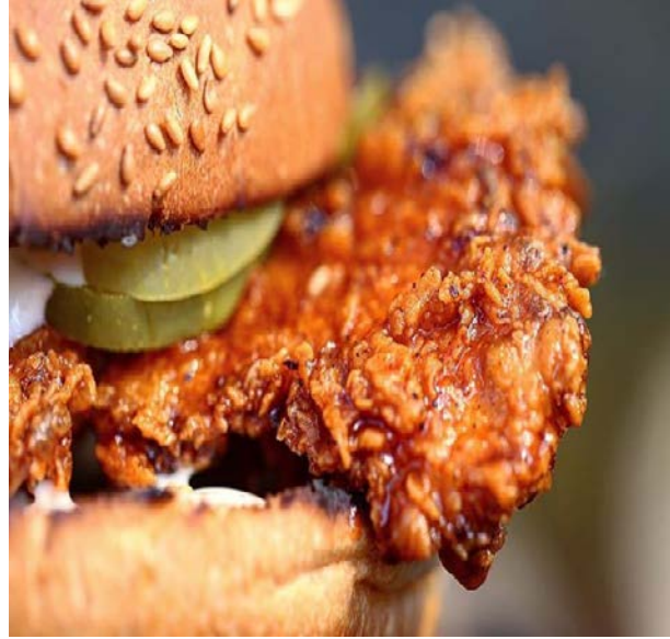
Spicy Fried Chicken Sandwich Blue Oak BBQ (New Orleans) blueoakbbq.com