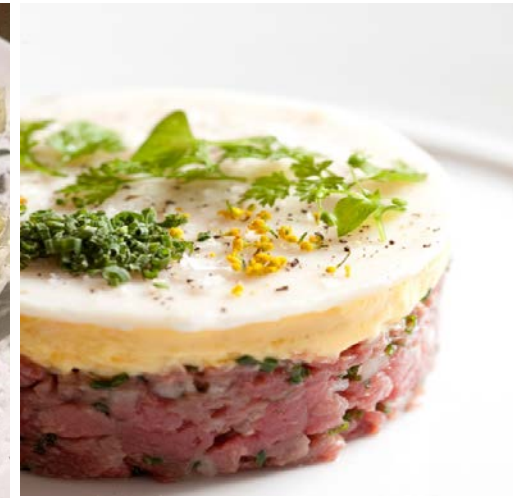
Beef Tartare, Deviled Egg, Bone Marrow