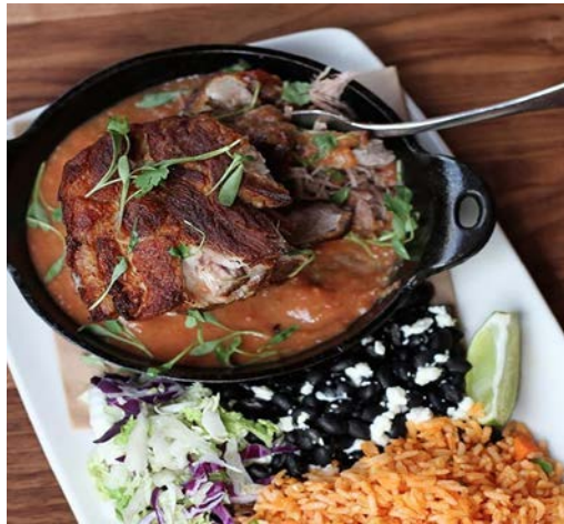
Slow-Braised Pork Shoulder Lazy Dog Café lazydogrestaurants.com