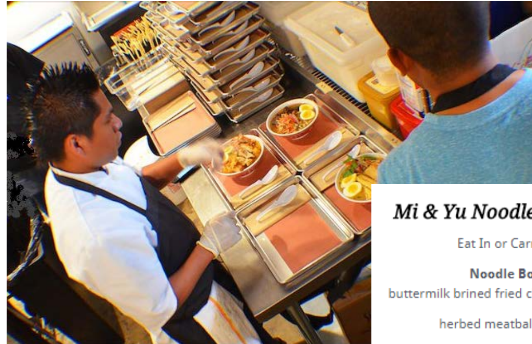
Mi & Yu Noodle Bar miandyunoodlebar.com (Baltimore, MD)