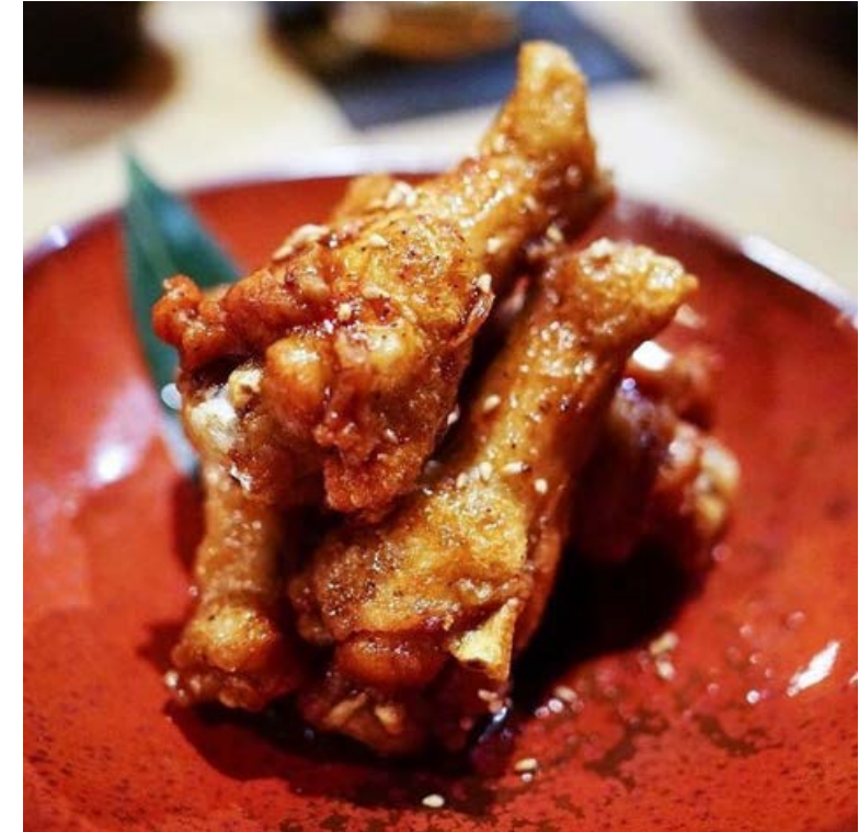
Nagoya Style Spicy Chicken Tori Shin (New York City) torishinny.com