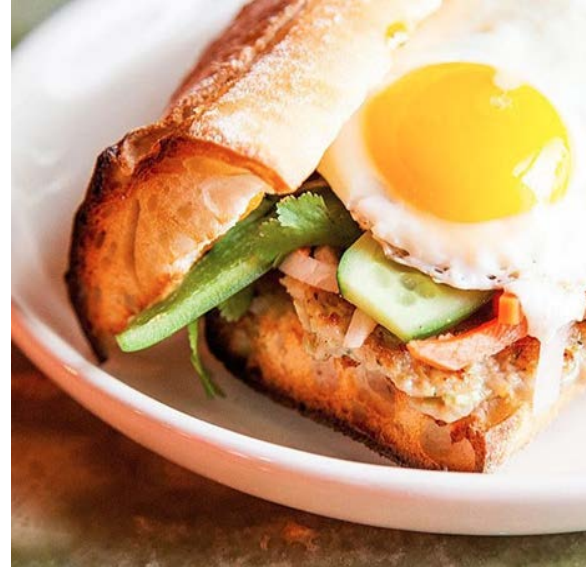
Brunch Banh Mi (Vietnamese-style Baguette , Aromatic Chicken Sausage, Pickled Carrot & Daikon, Spicy Mayo, Cilantro & Two Fried Eggs) E.P. & L.P. (Los Angeles) eplosangeles.com