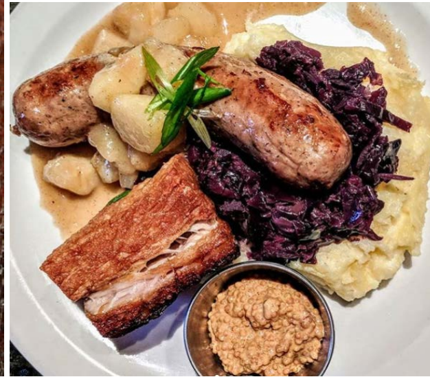
House Pork Garlic Sausage, Resurrection Ale- Braised Crispy Pork Belly Brewer's Art (Baltimore) brewersart.com