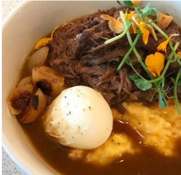
Hangover Bowl (braised short rib , grits, caramelized pearl onions, crispy garlic, poached egg) Willa Jean (New Orleans) willajeans.com