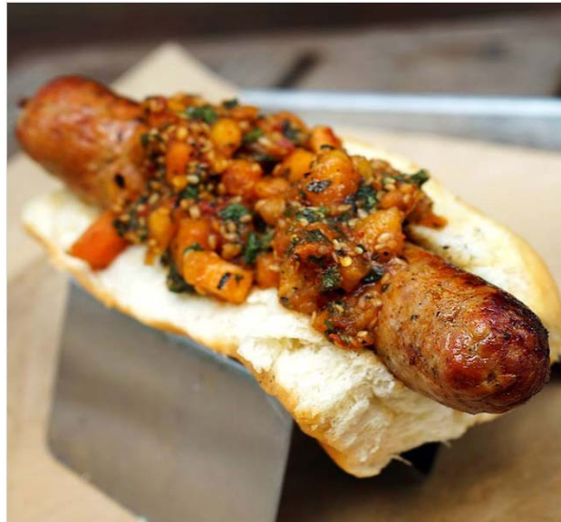
Sausage of the Day: Coconut, Ginger, Chicken & Pork (roasted papaya, sesame, mint & honey relish) Banger's Sausage House & Beer Garden (Austin) bangersaustin.com