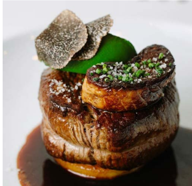
Rib Eye of American Wagyu Beef with Seared Foie Gras Bouchon Bistro (Yountville, CA) thomaskeller.com/bouchonyountville