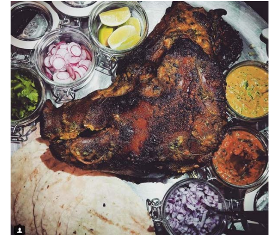
Pig's Head Platter B&O Brasserie (Baltimore) bandorestaurant.com