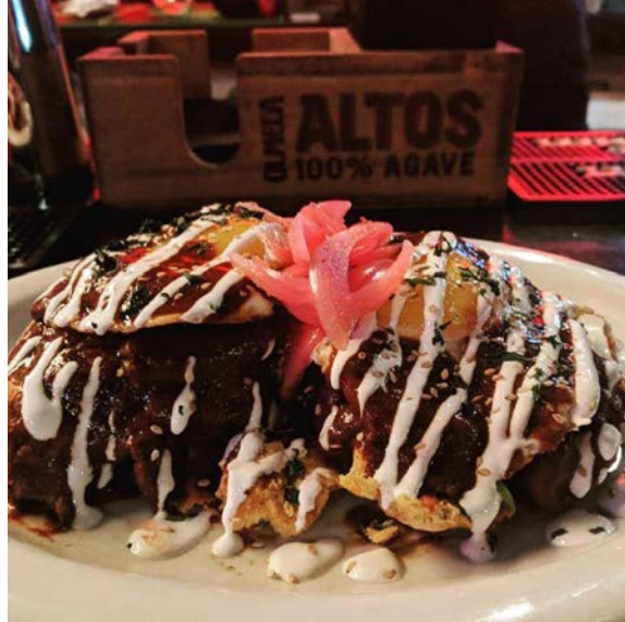
Open-Faced Chicken Mole Biscuit w/ Fried Egg Araña Taqueria y Cantina (New Orleans) aranataqueria.com