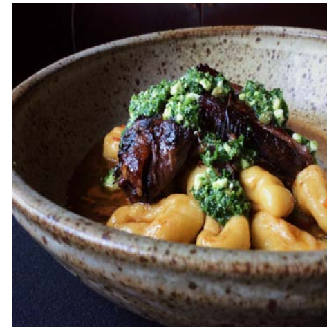
Lamb's Neck Ragout (w/ ricotta gnocchi) Lucques (Los Angeles) lucques.com