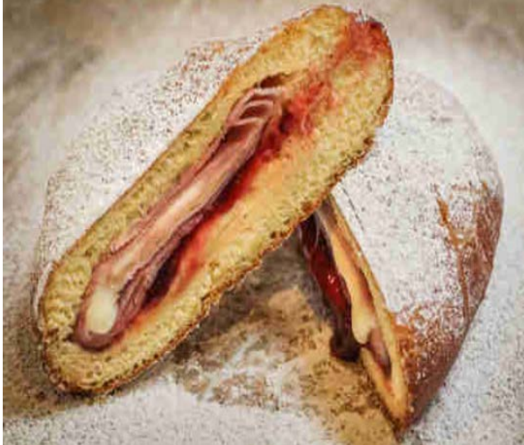
Monte Cristo Donut (Black Forest ham, Emmenthaler and American cheese, raspberry-cranberry jam) Donut Bar (San Diego) donutbar.com