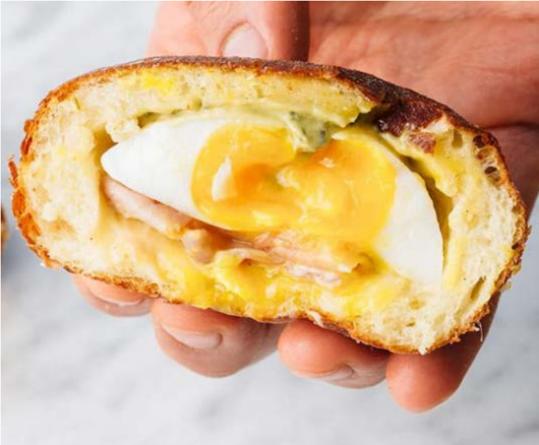
Breakfast Donut w/Country Ham, Egg, Basil Hollandaise Sidecar Donuts (Santa Monica, CA) sidecardoughnuts.com