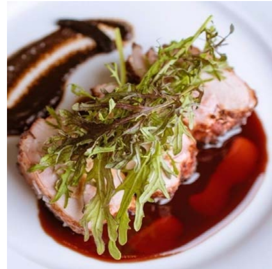
Chicken Thighs alla Cacciatora (peppers, onion, porcini, tomato, poached potatoes) Barbacoa (San Francisco) barbacoasf.com