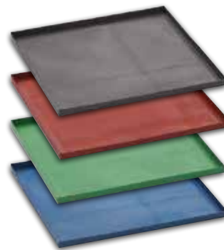
Solid base baskets (full size, black, red, green, blue)