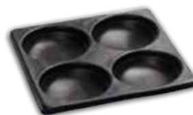
Non-stick mould 4x