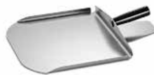
Paddle with hand guard and sides