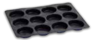
Non-stick mould 12x