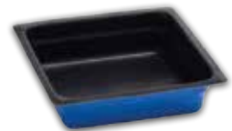
1/2L Container 1/6GN