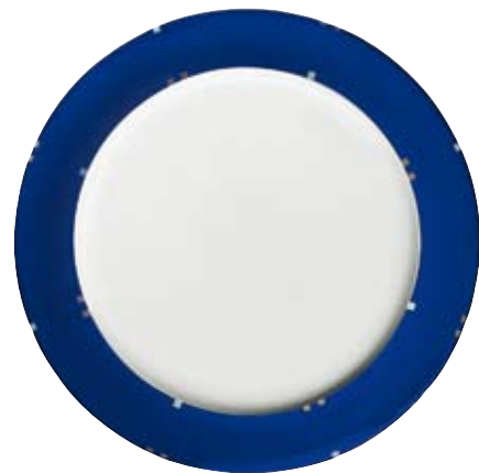
413380 Castino Blau

Nur auf Tellern und Unteren, Only on plates and saucers, Uniquement sur les assiettes et les soucoupes, Solo en platos y platitos, Solo su piatti e piattini