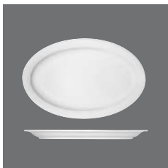
Platte oval Fahne , Platter oval with rim, Plat ovale à l'aile, Fuente oval con ala, Piatto ovale