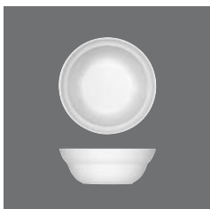
Bowl , Bowl, Bol, Bowl, Zuppiera piccola