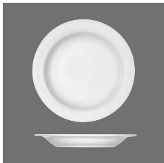
Teller halbtief Fahne , Plate half-deep with rim, Assiette demi-creuse à l'aile, Plato medio hondo con ala, Piatto semifondo