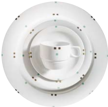
413390 Castino Weiß