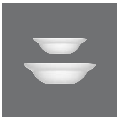
Salatiere rund , Salad dish round, Saladier rond, Ensaladera redonda, Insalatiera rotonda