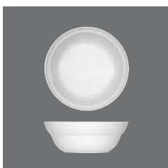
Bowl , Bowl, Bol, Bowl, Zuppiera grande