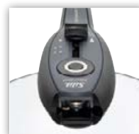
Three preset cooking levels.