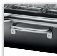
Ovenproof All-metal handles.