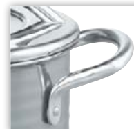
Ovenproof all-metal handles.