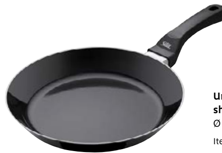
Universal frying pan, shallow