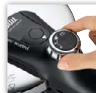
Innovative one-hand control dial.