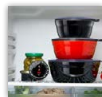
Stackable to save space.

Silargan® functional ceramic: Ideal for authentic-tasting preparation, serving and storage.