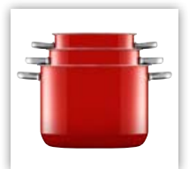
Stackable to save space.