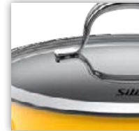
See-through lid made of high-quality, heat-resistant glass.