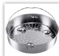
Practical special inserts.