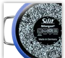
Suitable for all types of hob.

Finger protection on the sides for greater comfort and safety.