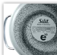
Suitable for all types of hob.