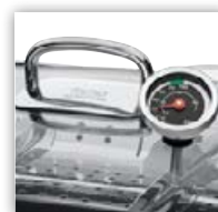
Thermometer for optimal control of the cooking process.