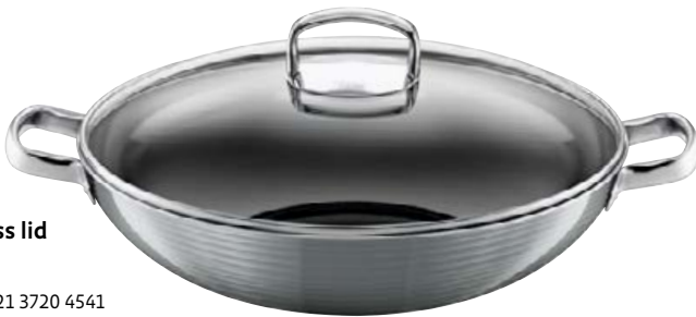
Wok with glass lid Ø 36 cm Item no.: 21 3720 4541