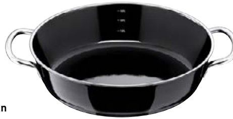
High stewing pan with metal handles