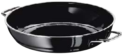
Roasting and serving pan with metal handles