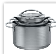
Stackable to save space.