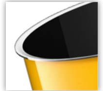
External pouring rim.