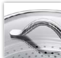
See-through lid with stainless steel rim.