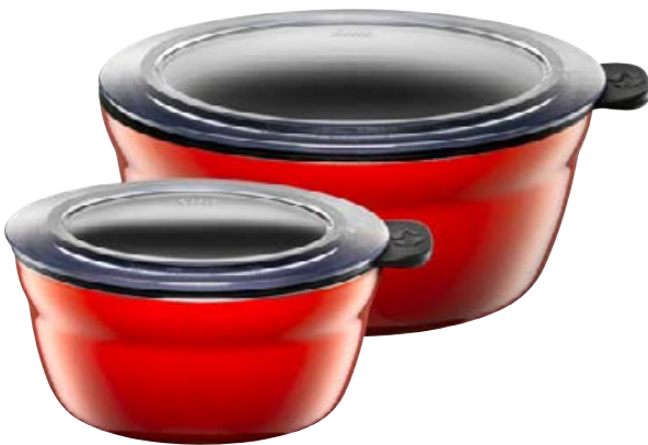
Fresh Bowls 2-piece set | with Twist'n Lift aroma lid | Ø 12, 16 cm Item no.: 21 3329 1602 (Energy Red)

The Fresh Bowls made from Silargan® are available in these colours: