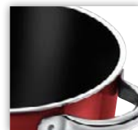
External pouring rim.