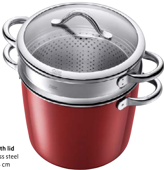
Pasta pot with lid With stainless steel insert | Ø 24 cm Item no.: 21 3127 4971