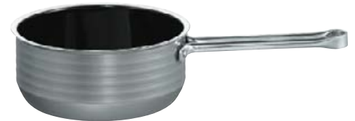
Saucepan without lid Ø 16 cm Item no.: 21 0420 4534