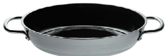
Frying and oven pan Ø 24, 28 cm Item no.: 21 1120 4602 (Ø 24 cm)