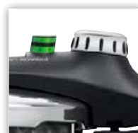
Clearly visible cooking level display.