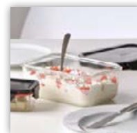
Ideal for serving.