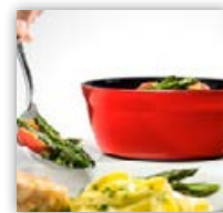
Arrange and serve appetisingly.