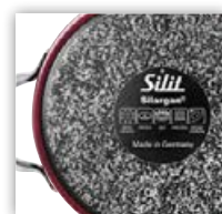
Suitable for all types of hob.

See-through lid made from high quality, heat-resistant glass with a stainless steel rim.