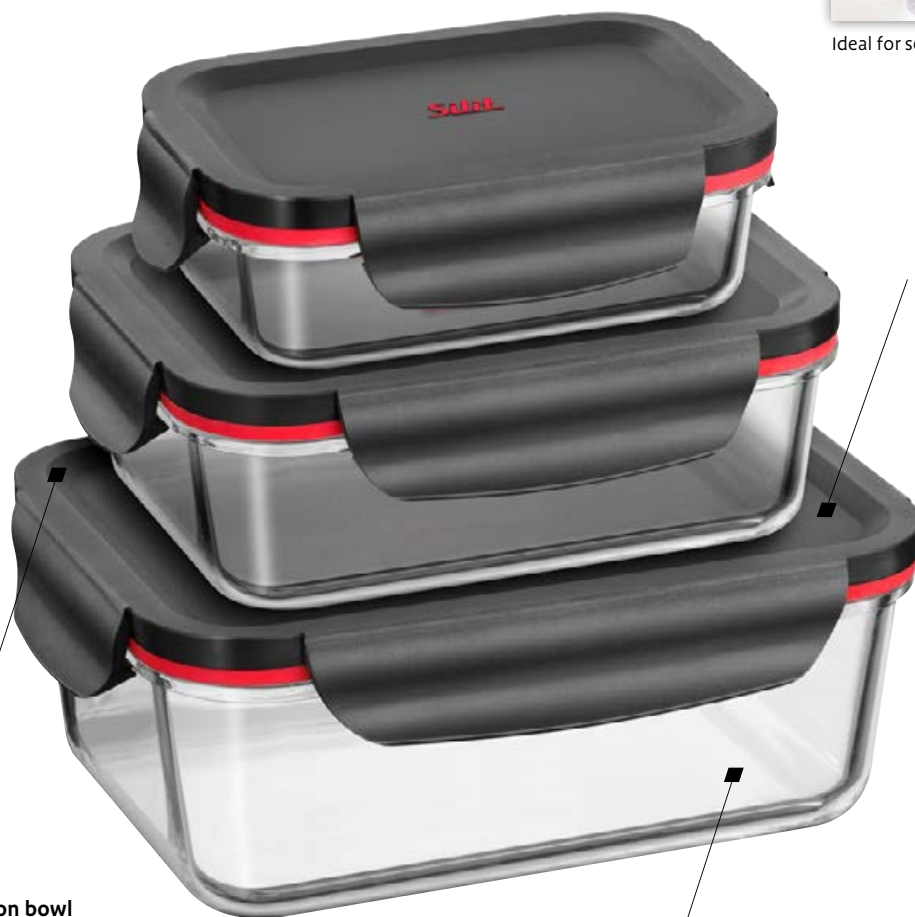
Stackable to save space, with or without lids.