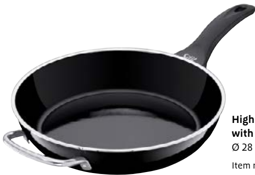
High universal frying pan with auxiliary handle