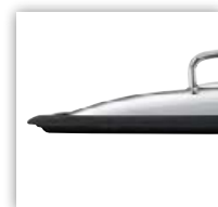
See-through lay-on lid with special rim.