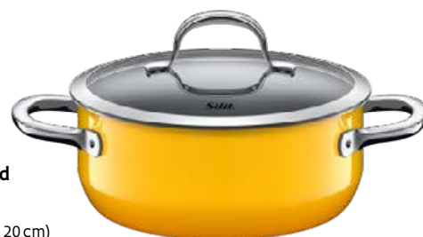
Low casserole with lid Ø 16, 20, 24 cm Item no.: 21 0129 8113 (Ø 20 cm)