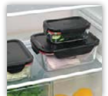
Stackable to save space.