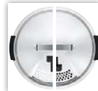
With functional Control Lid.