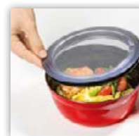
Stays fresh for longer thanks to the Twist'n Lift aroma lid.