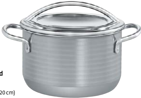
High casserole with lid Ø 16, 20, 24 cm Item no.: 21 0220 4503 (Ø 20 cm)