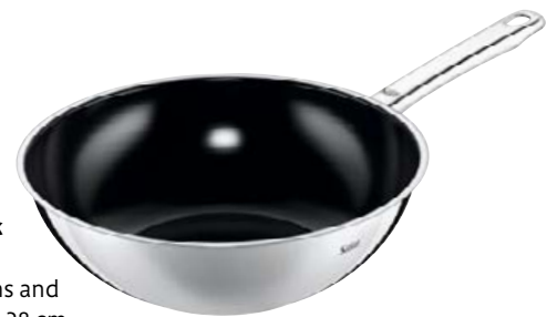
Non-stick Wuhan wok with steel handle Ideal for larger portions and amounts of liquid. | Ø 28 cm Item no.: 21 3726 3753