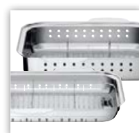
Versatile thanks to two different inserts with dividers.