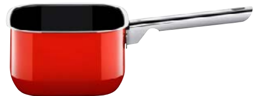
Saucepan without lid 16×16 cm (W×D) Item no.: 21 0429 5662

All products from the Quadro® series are available in these colours: