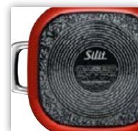
Suitable for all types of hobs.