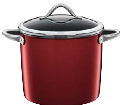
Stock pot with lid Ø 24 cm Item no.: 21 0327 4940