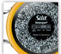
Suitable for all types of hob.

See-through lid made from high quality, heat-resistant glass with a stainless steel rim.