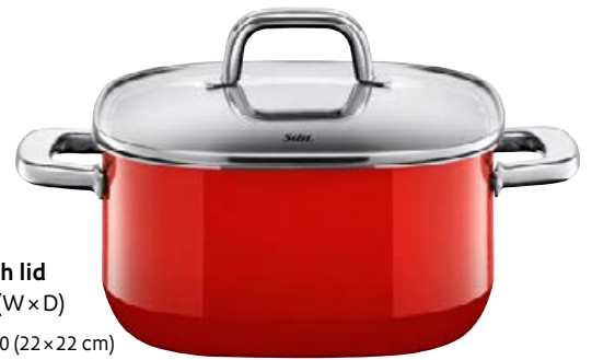
Low casserole with lid 16×16, 22×22 cm (W×D) Item no.: 21 0129 5600 (22×22 cm)