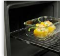
Heat-resistant, glass bottom part is suitable for the microwave and oven.