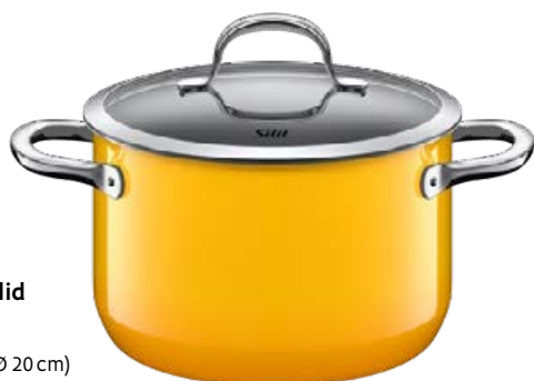
High casserole with lid Ø 16, 20, 24 cm Item no.: 21 0229 8144 (Ø 20 cm)