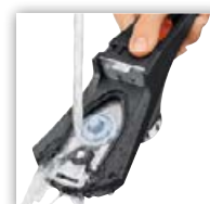
Detachable handle for easy and thorough cleaning.