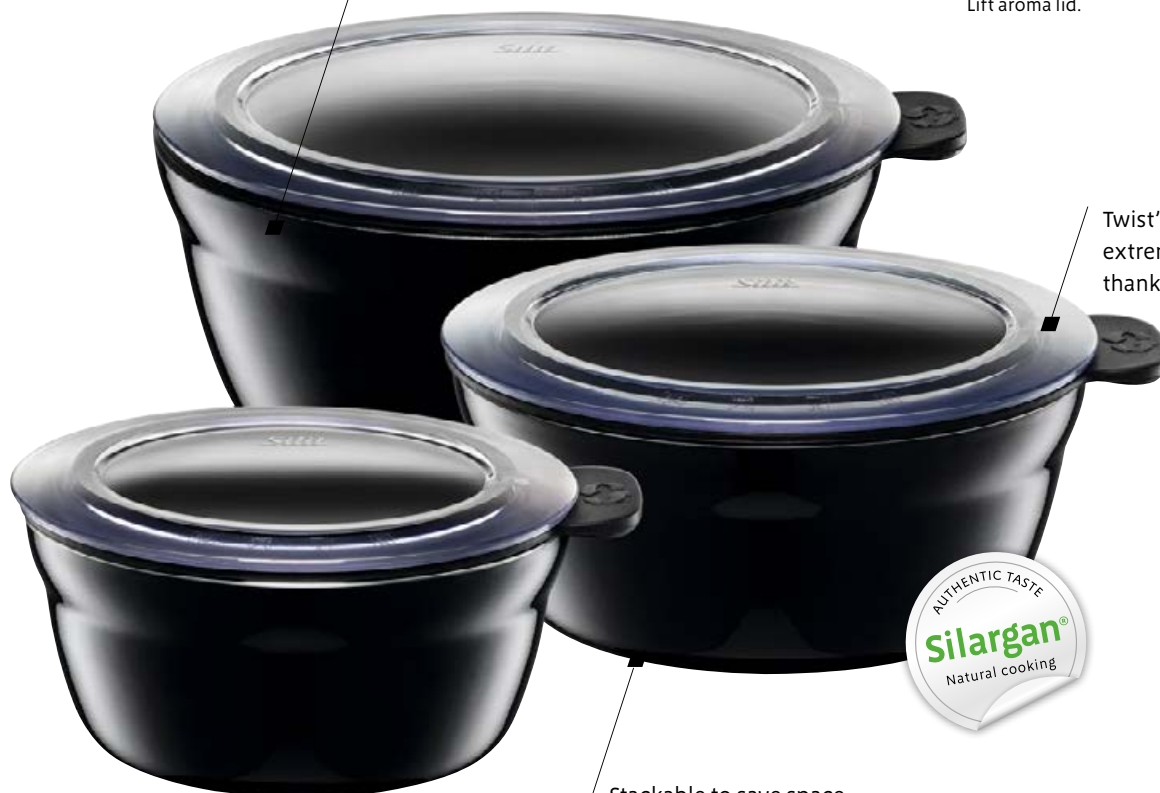
Stackable to save space.

Twist'n Lift aroma lid – extremely easy to open thanks to simple technology.