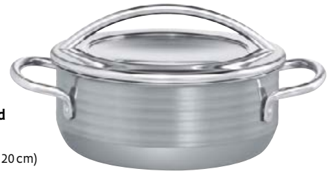
Low casserole with lid Ø 16, 20, 24 cm Item no.: 21 0120 4473 (Ø 20 cm)