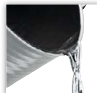
External pouring rim.