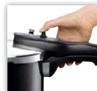
The ultimate in user-friendliness.