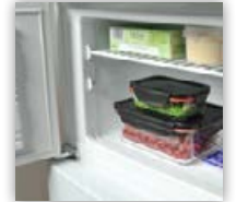
Storage in the refrigerator and freezer.