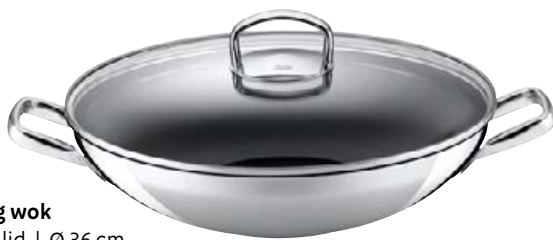
Hong Kong wok With glass lid | Ø 36 cm Item no.: 21 3726 4446

CeraProtect® 5-Year Guarantee* PTFE-FREE · ANTIHAFT · NON-STICK