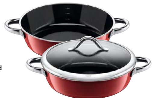
Roasting pan without lid With practical inside scale | Ø 28 cm Item no.: 21 1128 4819