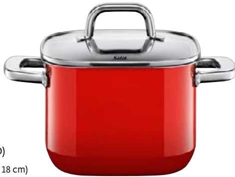
High casserole with lid 18×18, 22×22 cm (W×D) Item no.: 21 0229 5624 (18×18 cm)