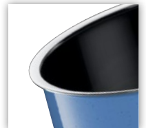
External pouring rim.