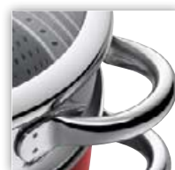
Ovenproof all-metal handles.