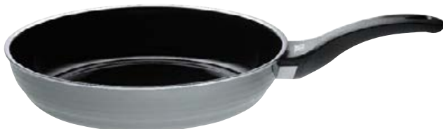
Deep universal frying pan Ø 20, 24, 28 cm Item no.: 21 1020 4572 (Ø 24 cm)