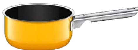
Saucepan without lid Ø 16 cm Item no.: 21 0429 8168

All products from the Passion series are available in these colours: