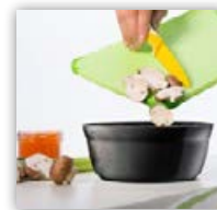
Ideal for preparation.