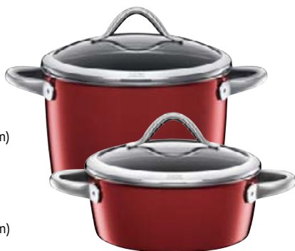
High casserole with lid Ø 16, 18, 22, 24 cm Item no.: 21 0227 4926 (Ø 22 cm)