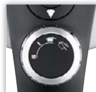
Three preset cooking levels.