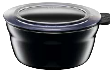
Fresh Bowl With Twist'n Lift aroma lid | Ø 12, 14, 16 cm Item no.: 21 3328 7278 (Piano Black, Ø 14 cm)