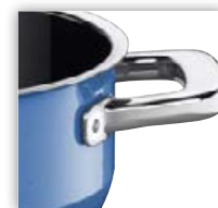
Ovenproof all-metal handles.