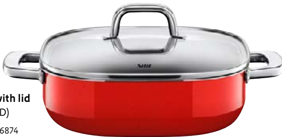
Roasting pan with lid 26×26 cm (W×D) Item no.: 21 1129 6874