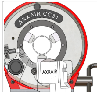
Concentric clamping with 3 jaws in stainless steel to eliminate tube distortion