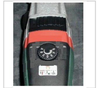
Adjustment via the speed changer