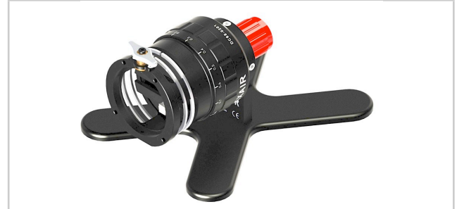
Optionally, we can supply a package with a DC65 head