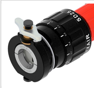
Jaw opens wide for easy positioning of tube.