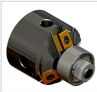
V bevel with profile guide roller