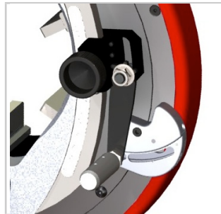
Outer profile guide system: to account for tube "out of round"