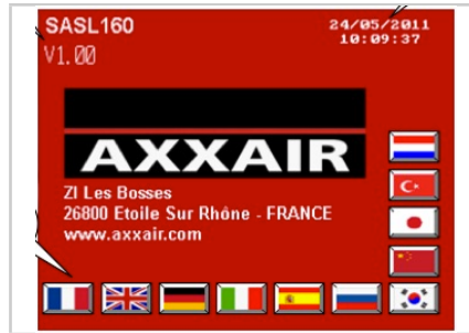
5.7" multi-language, colour touch screen