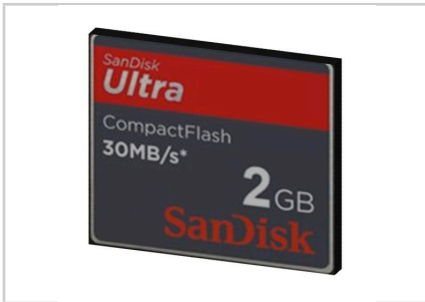
SD Flash card with 200 programs per card