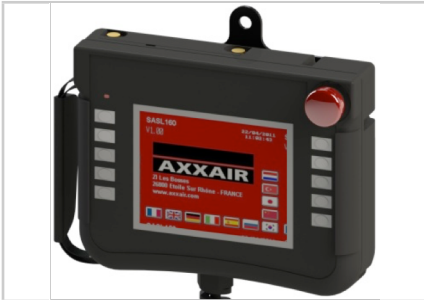
5.7" colour touch screen remote control. Secure, multi-lingual access