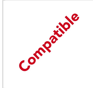
Compatible with AMI power sources ( 205, 207 models )