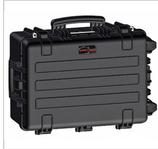
All machines are delivered in their individual case