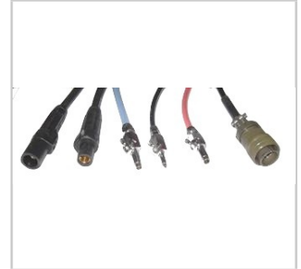
Connectors compatible for AMI power sources