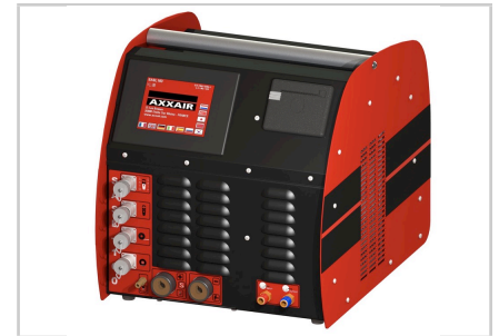
Driven by AXXAIR power source ( cf compatibility table )