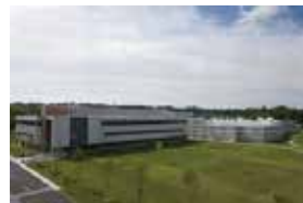
2011 Merck and Company, Inc. Global Clinical Supplies Manufacturing