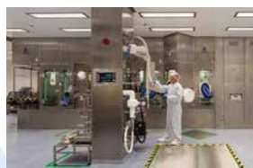
2013 Merck & Co., Inc. Vaccine and Biologics Sterile Facility (VBSF)