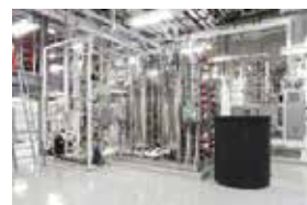
2015 Pharmeducence Aseptic Fill-Finish Facility