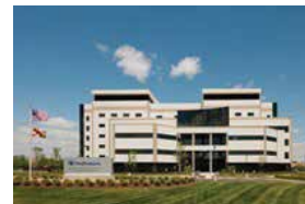
2011 MedImmune, LLC Mammalian Cell Culture-based Production Facility