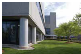
2010 Biogen Idec Facility of the Year Award Winner for Operational Excellence

MECO WATER SYSTEMS HAVE BEEN UTILIZED BY 16 ISPE CATEGORY WINNERS IN THE PAST 9 YEARS.