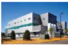
2014 Grifols Therapeutics, Inc. North Fractionation Facility