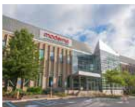
2019 Moderna, Inc. Facility of the Year Award Winner for Facility of the Future