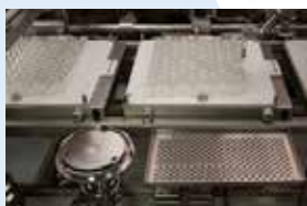
2013 Novartis Vaccines and Diagnostics United States Flu Cell Culture Facility