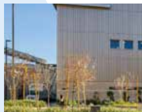
2018 Shire Facility of the Year Award Winner for Facility Integration