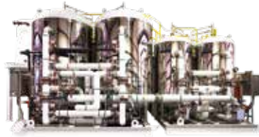
CARBON FILTERS & SOFTENERS