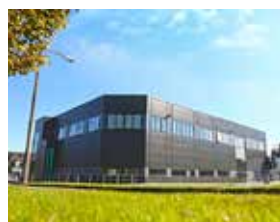
2019 Eli Lilly Facility of the Year Award Winner for Process Innovation