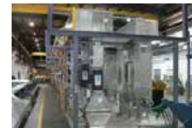
2012 Merck & Co., Inc. Vaccine Bulk Manufacturing Facility (VBF) Program of Projects