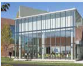
2017 Bristol-Myers Squibb Facility of the Year Winner for Biologics Development and the Clinical Manufacturing Building project