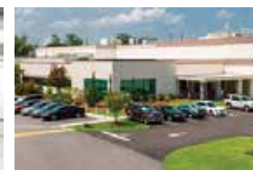
2016 West Pharmaceutical Services, Inc. Kinston, North Carolina Facility