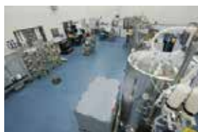
2013 Biogen Idec Flexible Volume Manufacturing (FVM) Facility