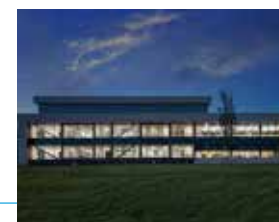
2019 Takeda Facility of the Year Award Honorable Mention