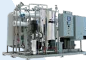
MASTERPAK™ (PRETREATMENT, RO & EDI)