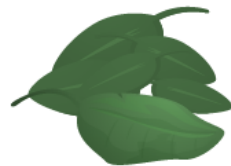
Dark, leafy greens