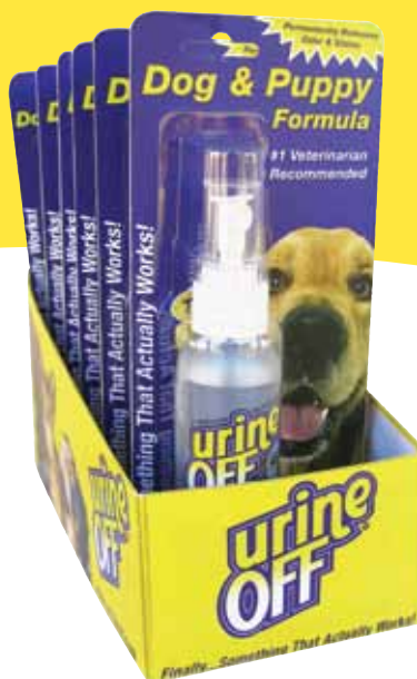
Urine Off Dog & Puppy Formula Sprayer with Countertop Display SKU: PT4010 - 1/case Size: 4 oz