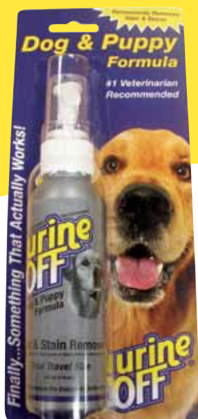
Urine Off Dog & Puppy Formula Sprayer Blister Packaging SKU: PT4006 - 12/case Size: 4 oz

Now consumers can try Urine Off for a fraction of the price. Once consumers discover the effectiveness of Urine Off, they'll be hooked!