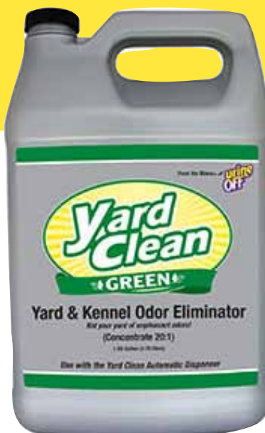
4 - 1 gal. bottles Yard Clean Green Yard & Kennel Odor Eliminator (4.75"d x 11.5"h x 7.25"w)