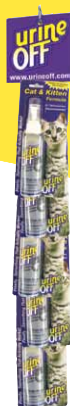
Urine Off Cat & Kitten Formula Sprayer Blister Packaging / Clip Strip SKU: PT4011 - 12/case Size: 4 oz