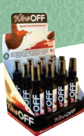
12 - 4 oz. bottles WineOFF 1 - Countertop Display (8" w x 6.25" d x 12.75" h) Case SKU: MR1068

Made with nature-based, non-toxic ingredients, WineOFF and CoffeeOFF are safe to use around people and pets. The biodegradable ingredients are environmentally friendly as well.