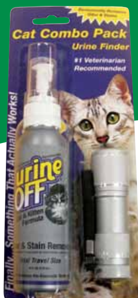
Urine Off Cat & Kitten Formula Sprayer plus LED Urine Finder SKU: PT4013 - 12/case Size: 4 oz

Now consumers can try Urine Off for a fraction of the price. Once consumers discover the effectiveness of Urine Off, they'll be hooked!