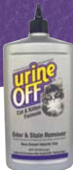
Urine Off Cat Formula with Carpet Injector Cap SKU: PT6061 - 12/case Size: 16 oz