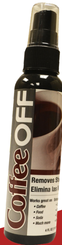
118ml. bottle CoffeeOFF