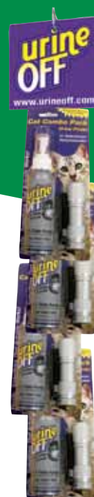
Urine Off Cat & Kitten Formula Sprayer plus LED Urine Finder Clip Strip SKU: PT4020 - 12/case Size: 4 oz