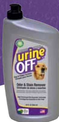
Urine Off Dog Formula with Carpet Injector Cap SKU: PT6048 - 12/case Size: 32 oz

Urine Off is the urine odor and stain remediation product that carries the “Seal of Approval” from the Carpet and Rug Institute, the U.S. Carpet Authority. Urine Off is the official show-ring cleaning agent for Crufts, the world’s largest dog show, and is safe on all surfaces – even hardwood floors. Urine Off products meet strict EU standards for bio-degradability and are safe to use around pets and humans.