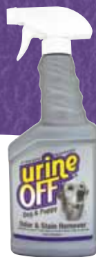
Urine Off Dog Formula with Sprayer Top SKU: PT6006 - 12/case with Induction Seal SKU: PT6011 - 12/case Size: 500 ml