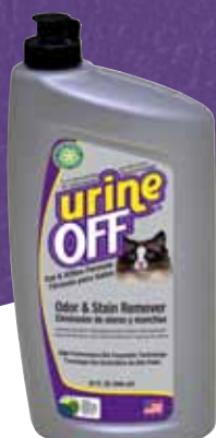
Urine Off Cat Formula with Carpet Injector Cap SKU: PT6053 - 12/case Size: 32 oz

Urine Off is the urine odor and stain remediation product that carries the “Seal of Approval” from the Carpet and Rug Institute, the U.S. Carpet Authority. Urine Off is the official show-ring cleaning agent for Crufts, the world’s largest dog show, and is safe on all surfaces – even hardwood floors. Urine Off products meet strict EU standards for bio-degradability and are safe to use around pets and humans.