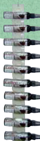
10 - 4 oz. bottles CoffeeOFF 1 - Clipstrip Display (1.5" d x 6.625" w x 29.5" h) Case SKU: MR1073