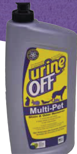
12 - 32 oz. bottles Multi-Pet (2.5"d x 9"h x 4.5"w) Case SKU: MR1051