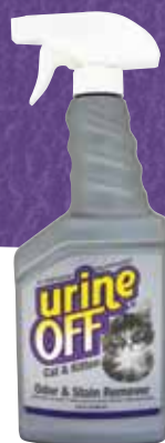
Urine Off Cat Formula with Sprayer Top with Induction Seal SKU: PT6000 - 12/case SKU: PT6005 - 12/case Size: 500 ml