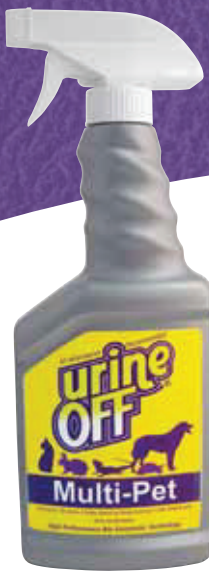
12 - 500 ml. bottles Multi-Pet (2.25"d x 8.75"h x 3.75"w) Case SKU: MR1002

Urine Off is the urine odor and stain remediation product that carries the “Seal of Approval” from the Carpet and Rug Institute, the U.S. Carpet Authority. Urine Off is the official show-ring cleaning agent for Crufts, the world’s largest dog show and is safe on all surfaces – even hardwood floors. Urine Off products meet strict EU standards for bio-degradability and are safe to use around pets and humans.