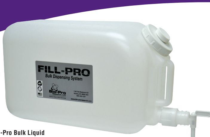
Fill-Pro Bulk Liquid Dispensing System SKU: BU2600- 1/each Size: 5 gallons

Urine Off Equine Formula is packaged in a convenient gallon and reusable fill-pro container. The equine one gallon concentrate make 5 gallons of ready to use cleaning solution.