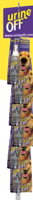
Urine Off Dog & Puppy Formula Sprayer Blister Packaging / Clip Strip SKU: PT4018 - 12/case Size: 4 oz