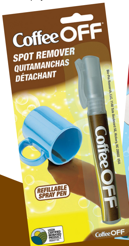
10ml Spray Pen CoffeeOFF