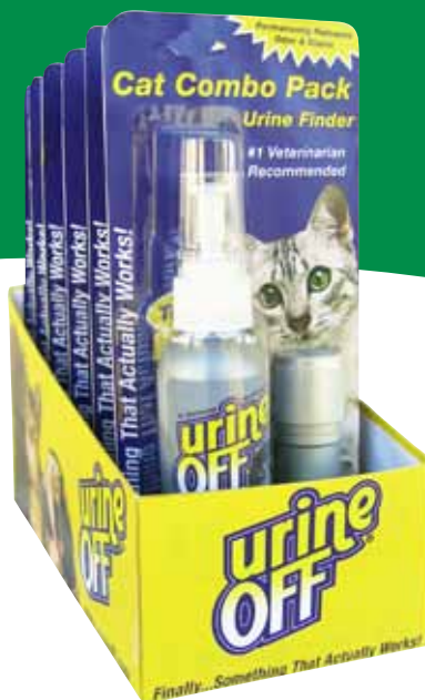
Urine Off Cat & Kitten Formula Sprayer plus LED Urine Finder Countertop Display SKU: PT4016 - 6/case Size: 4 oz