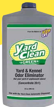
12 - 32 oz. bottles Yard Clean Green Yard & Kennel Odor Eliminator (2.5"d x 9"h x 4.5"w)

Keep the yard, kennel, or "convenience" area fresh and clean-smelling with Yard Clean Green.