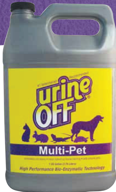
4 - 1 gal. bottles Multi-Pet (4.75"d x 11.5"h x 7.25"w) Case SKU: MR1009