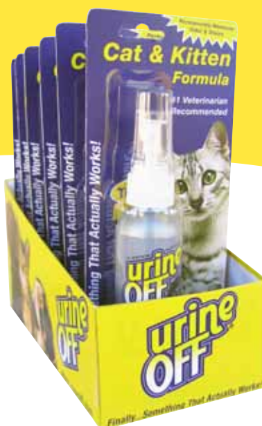
Urine Off Cat & Kitten Formula Sprayer with Countertop Display SKU: PT4019 - 12/case Size: 4 oz