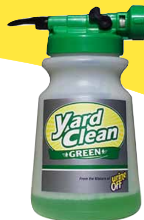
Yard Clean Green Hose End Proportioning Sprayer (4.25"d x 7.875"h x 5.5"w)