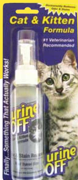
Urine Off Cat & Kitten Formula Sprayer Blister Packaging SKU: PT4008 - 12/case Size: 4 oz

Now consumers can try Urine Off for a fraction of the price. Once consumers discover the effectiveness of Urine Off, they'll be hooked!