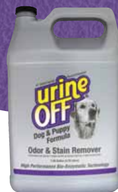
Urine Off Dog Formula with 38 mm Cap SKU: PT6009 - 4/case Size: 1 gallon