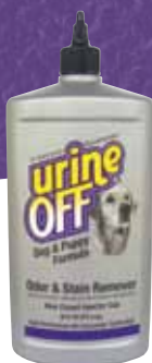
Urine Off Dog Formula with Carpet Injector Cap SKU: PT6058 - 12/case Size: 16 oz