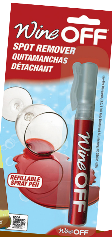
10ml Spray Pen WineOFF