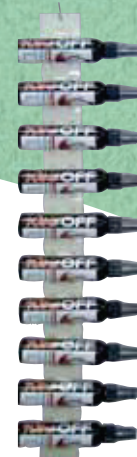
10 - 4 oz. bottles WineOFF 1 - Clipstrip Display (1.5" d x 6.625" w x 29.5" h) Case SKU: MR1074