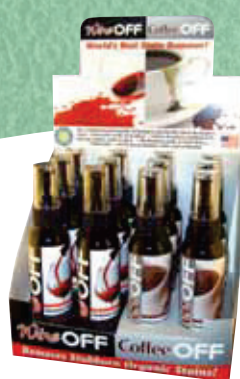
6 - 4 oz. bottles CoffeeOFF 6 - 4 oz. bottles WineOFF 1 - Countertop Display (8" w x 6.25" d x 12.75" h) Case SKU: MR1060