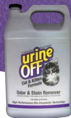
Urine Off Cat Formula with 38 mm Cap SKU: PT6003 - 4/case Size: 1 gallon