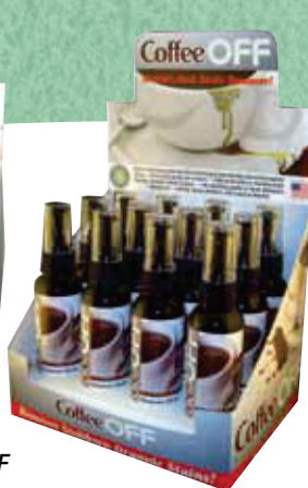
12 - 4 oz. bottles CoffeeOFF 1 - Countertop Display (8" w x 6.25" d x 12.75" h) Case SKU: MR1067