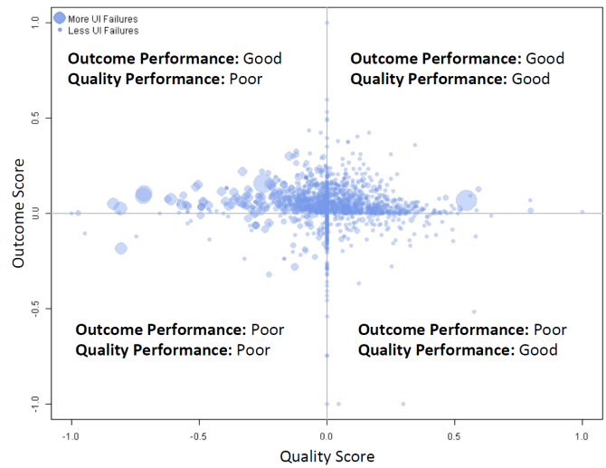
Figure 2. Example results from the multidimensional outcomes model. The Utilization Intensity score is represented by bubble size (a larger bubble represents a lower score).

Elder Research is a recognized leader in the science, practice, and technology of advanced analytics. We have helped government agencies and Fortune Global 500® companies solve real-world problems across diverse industries. Our areas of expertise include data science, text mining, data visualization, scientific software engineering,