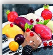
Sorbets & Ice Creams