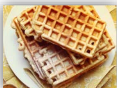
Dough & Pastry