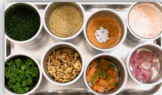
Fresh chop – herbs/meats/nuts