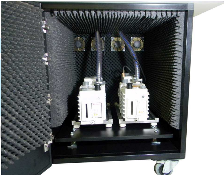
Noise enclosure for vacuum pumps