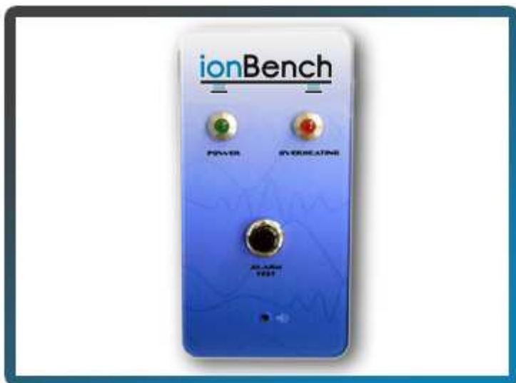
Overheating temperature alarm