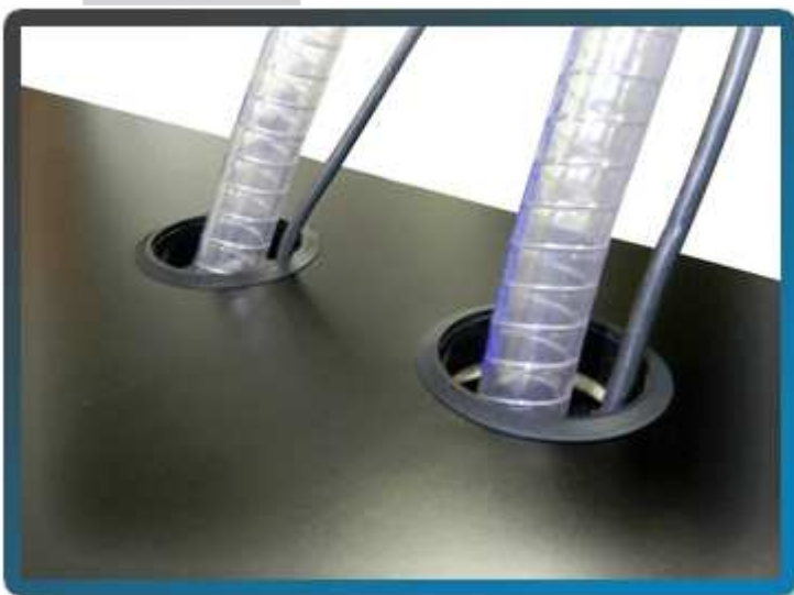
Pipe and cable management