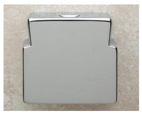
ComfortFlo Steam Head