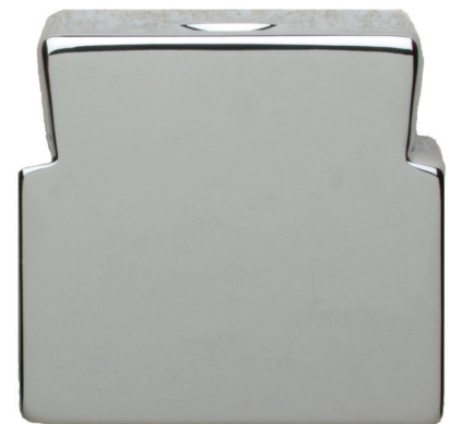
ComfortFlo Steam Head