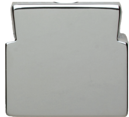
ComfortFlo Steam Head