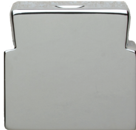
ComfortFlo Steam Head 2-3/4" H x 3" W x 1-7/16" D