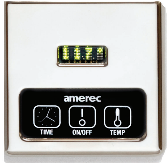
K60 Digital Control 3" H x 3" W x 1/4" D