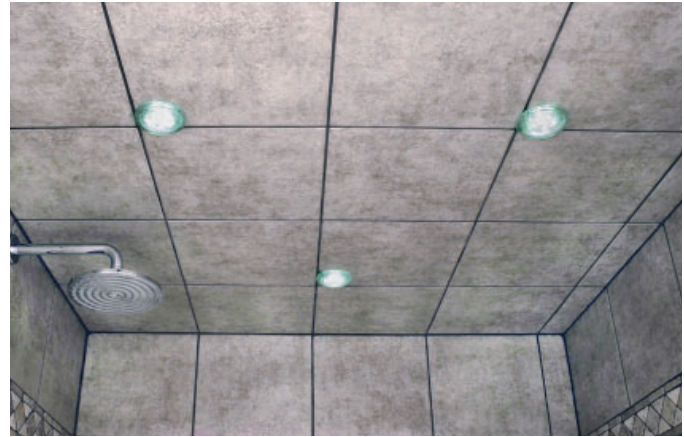
Chromatherapy/White LED Light Kit