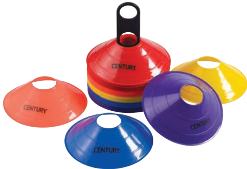
Saucer Cone Set Imported SIZE: 9" DIAMETER COLORS: MULTIPLE COLORS PER SET (COLORS MAY VARY) #10625 SALE $9.74 REG WHLSE $12.99