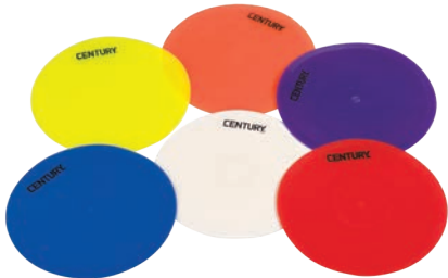
Agility Dots (6 per set) Imported SIZE: 8" DIAMETER COLORS: MULTIPLE COLORS PER SET (COLORS MAY VARY) #10621 SALE $9.74 REG WHLSE $12.99