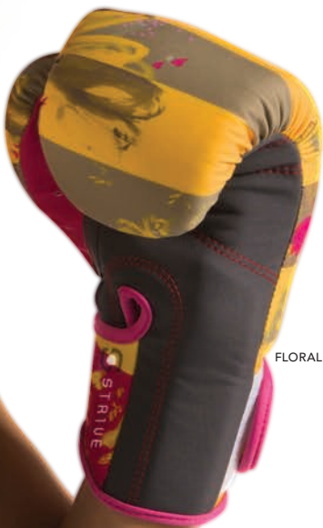
FLORAL NEGATIVE YELLOW

Strive Washable Boxing Gloves Imported SIZE: 10 OZ. SALE $14.99 REG WHLSE $29.99