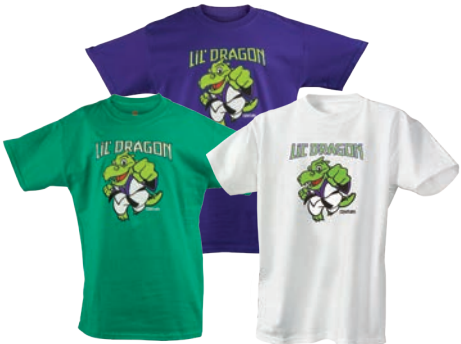
Lil’ Dragon® Tee USA/Imported SIZES: YOUTH: S, M, L; ADULT: S, M, L, XL COLORS: GREEN, PURPLE, OR WHITE #0928 SALE $10.39 REG WHSE $12.99