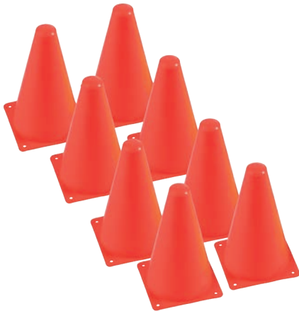
9" Cones (8 per set) Imported SIZE: 9" TALL COLOR: ORANGE #10626 SALE $5.24 REG WHLSE $6.99