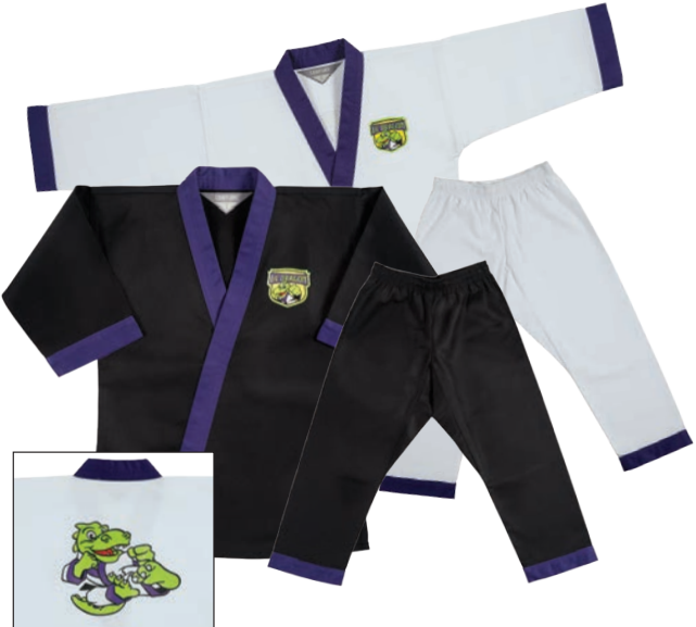
Lil’ Dragon® Uniform Imported SIZES: 000-3 COLORS: BLACK OR WHITE #04115