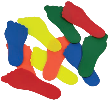
Feet Forms (4 pair) SIZE: 9" LONG COLORS: MULTIPLE COLORS PER SET #10622 SALE $9.74 REG WHLSE $12.99