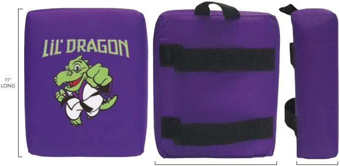
Lil’ Dragon® Hand Target USA/Imported SIZE: 9" W X 11" L X 3" T COLOR: PURPLE #1058 SALE $10.39 REG WHSE $12.99