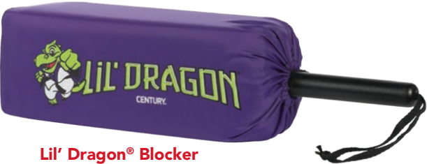
Lil’ Dragon® Blocker USA/Imported SIZE: TARGET: 12" X 4.5"; HANDLE: 5" COLOR: PURPLE #1057 SALE $11.19 REG WHSE $13.99