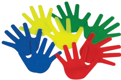
Hand Forms (4 pair) Imported SIZE: 7.5" LONG COLORS: MULTIPLE COLORS PER SET (COLORS MAY VARY) #10623 SALE $9.74 REG WHLSE $12.99