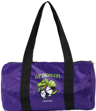
Lil’ Dragon® Duffle Bag Imported SIZE: 14.5" L COLOR: PURPLE #2160 SALE $7.19 REG WHSE $8.99