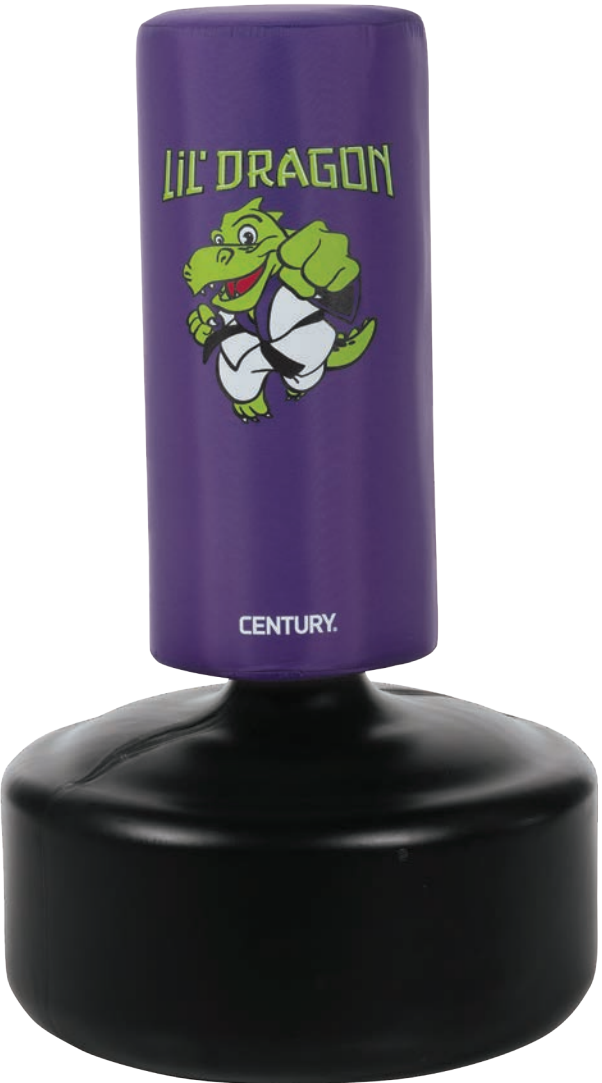
Lil’ Dragon® Wavemaster® USA/Imported SIZE: BAG: 10.5" DIAMETER X 26" TALL STRIKING SURFACE; BASE DIAMETER: 22" WEIGHT: APPROX. 170 LBS. WHEN FILLED WITH WATER COLOR: PURPLE #101531 SALE $63.99 REG WHSE $79.99