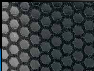
TEXTURED NEOPRENE GRIPS ON THE SOLE

You wouldn't wear normal socks on the training mats. But Mat Sox are far from normal! They're designed to give you traction on your mats and training floors, for fewer "slip"-ups. But don't take my word for it! Here's what real school owners and wearers have said: