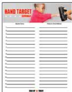
SIGN UP SHEET