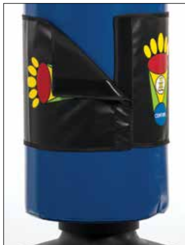
HOOK AND LOOP CLOSURE