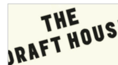
The Draft House