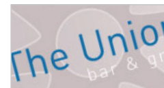
Union Bar & Grill