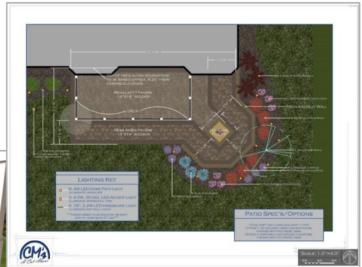
CM's designed and installed an expansion of the existing patio and renovated the landscape, as well as added a firepit and freestanding seatwall to the entertainment space.