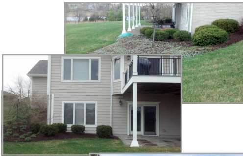
Before: This house already had an established landscape and paver patio.

At the beginning of each new year we enjoy looking back at projects our clients have entrusted us with and we look forward to the new relationships and the new projects we will build in the future. We hope you enjoy seeing these projects and we wish you a very happy new year!