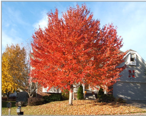
Red Sunset Maple

* When we "feed" the tree in the fall, the tree takes advantage of the nutrients by collecting and storing them.