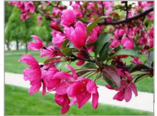
Royal Rain Drops Crab